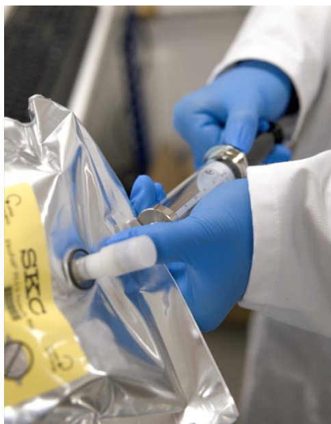
Gas analysis at Equisera involves taking an aliquot from the gas bags used for sample collection – which is necessary because the conditions in the biomass reactor preclude on-line sampling.

But the purity of their hydrogen, important as it is to the company, isn't the end of the story. The gasification process also results in solid biochar, and a small amount of liquid bio-oil (or tar). Understanding the chemicals present in these products is essential for working out the processes that are happening inside the reactor, and so optimising the yield of hydrogen. But the team also has an eye on keeping the whole process as 'circular' as possible by re-using these byproducts – for example, the biochar could be used for CO 2 capture, while the bio-oil could be added back into the feedstock, to generate more hydrogen.