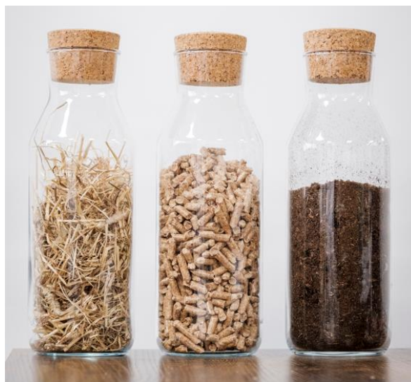
Straw, wood pellets and compost – just three of the biomass feedstocks that the team at Equisera have been investigating for hydrogen generation.

To demonstrate that their concept works in practice, the team at Equisera has been busy over the last two years developing a series of prototypes, which have steadily increased in scale, efficiency and robustness. Their reactor design has also been shown to work with a variety of different biomass feedstocks, including bioenergy crops, forestry residues, macro-algae as well as waste products such as oversized compost. The reactor even gives good results with waste plastic!